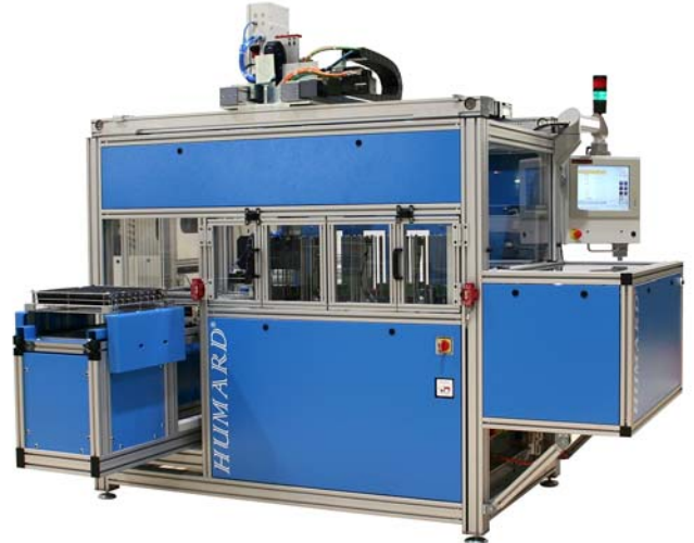
Automatic machine for packaging and control